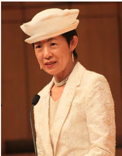
Her Imperial Highness Princess Takamado, Honorary Chair of ASSW 2015, presenting her opening address

It was arranged under the auspices of IASC and co-organized by the Science Council of Japan. In addition to the business meetings of the ASSW partner organizations, which were held during the first three days of the week (23-25 April), a joint 4-day science symposium of the 3 rd International Conference on Arctic Research Planning (ICARP III) and the 4 th International Symposium on Arctic Research (ISAR-4) was arranged in the second half of the week (27-30 April).