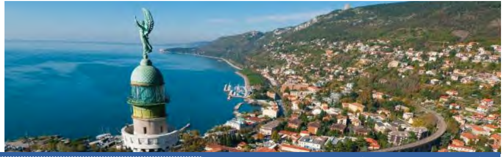
PAST Gateways International Conference Venue (Trieste, Italy)

career researchers and two keynote speakers at the conference. A special issue of Quaternary Science Reviews comprising papers related to the meeting will be published in 2015/16.