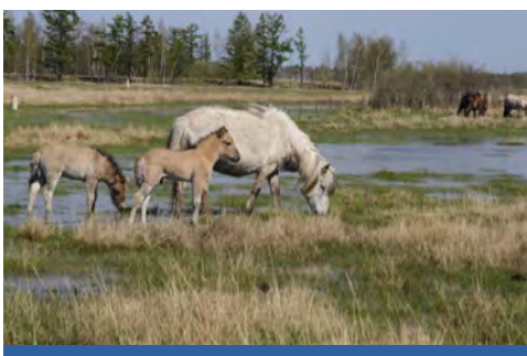
"Cryosphere and Culture" in Yakutia

The idea for this workshop on "Permafrost Dynamics and Indigenous Land Use" was owed to a conspicuous gap between different disciplines' research agendas: there is substantial expertise on permafrost (and related hydrological and soil processes) on the one hand, and on indigenous forms of land use that utilize thermokarst, on the other hand; but the two have thus far rarely been